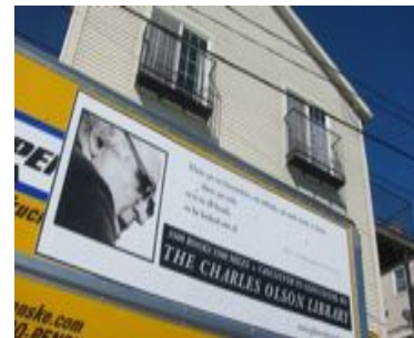
28 Fort Square, Gloucester