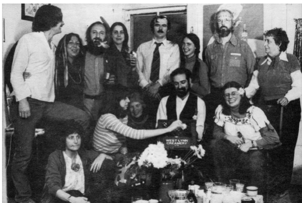
Dogtown College participants circa 1970's