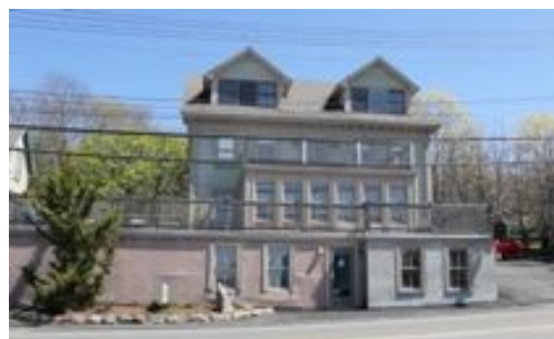
108 East Main Street