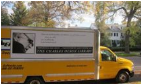
Outside of Garrison Keillor's office in Minneapolis, MN