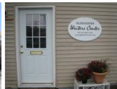
126 East Main Street