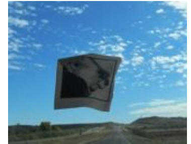
Olson guides the way.

Read more at the Maud / Olson Library link at gloucesterwriters.org