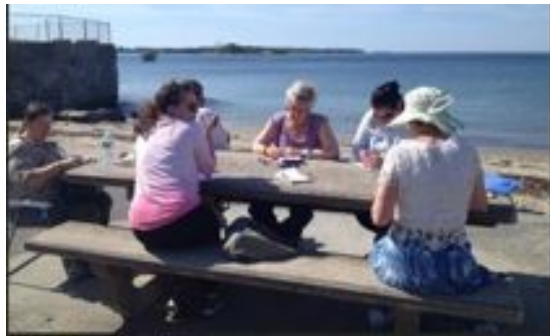
Women's Writers Group writing on-site at Pavilion Beach