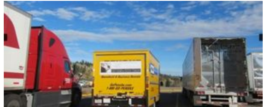
Truck Stop Route I-94 - Jamestown, North Dakota