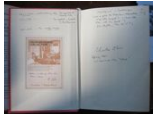
Charles Olson's bookplate

What is the value of all this? Ammiel Alcalay said at our recent Gala celebrating the library that "It's about resistance to throwing things out." Not only books and papers but music, ideas, even people. Our throw-away culture runs deep.