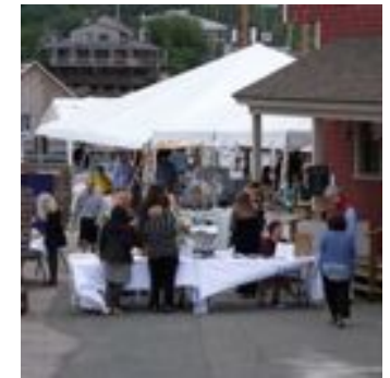
5th Anniversary Welcome Table